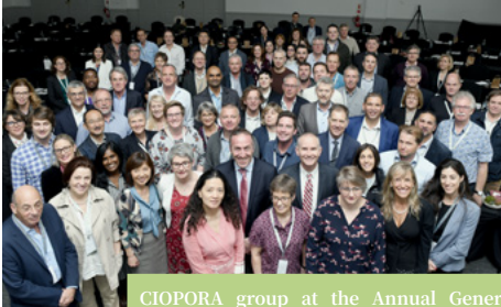
CIOPORA group at the Annual General Meeting in Stellenbosch, South Africa, 2019