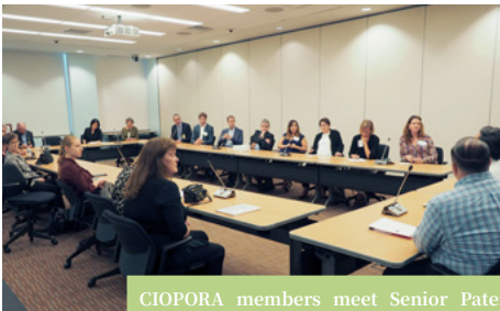
CIOPORA members meet Senior Patent Examiners at USPTO, Alexandria, VA, 2018

CIOPORA is more than an industry organization. It is a true community bringing together IP experts and green sector leaders to network, learn, share experiences, and grow their businesses.