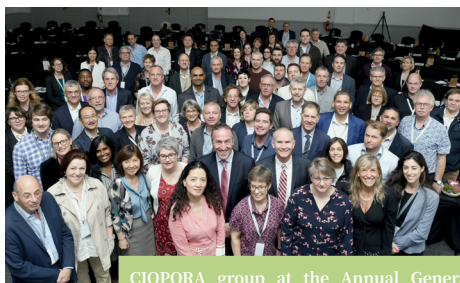
CIOPORA group at the Annual General Meeting in Stellenbosch, South Africa, 2019