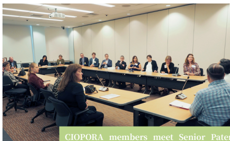
CIOPORA members meet Senior Patent Examiners at USPTO, Alexandria, VA, 2018